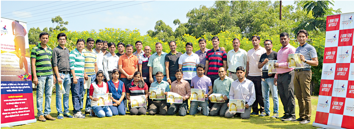
Amid inquiries about bulk bookings from various organisations and groups, Glenmark Pharmaceuticals Limited was the first to get 30 registrations done at the same time for Lokmat Aurangabad Marathon. A picture of the group on their office premises.

Those interested to register for the marathon in mega registrations can call up 9075005235 or visit www.mycitymarathon.com